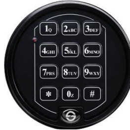
Keypad on front of safe door. This is a 12-key alphanumeric keypad used to enter PIN codes and programming commands.