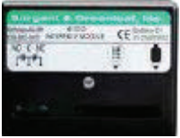
Duress Module (optional) Housed within the safe. this module must be connected to the lock to use the duress alarm feature.