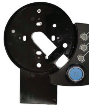
Keypad Extension Base Installed under the keypad. This is required when using the lock's Service Mode. The extension base provides a green LED to indicate "Status 1", and a red LED to indicate "Status 2" and a yellow LED to indicate "Mode" of lock operation. The extension base also provides a port for communication with Touch Keys.