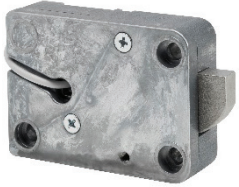
6106 Pivot bolt lock housed within the safe. Provides for Bank and Service modes of operation